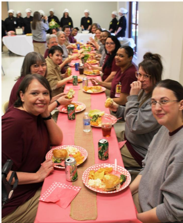
Televerde Graduates enjoy a celebration lunch